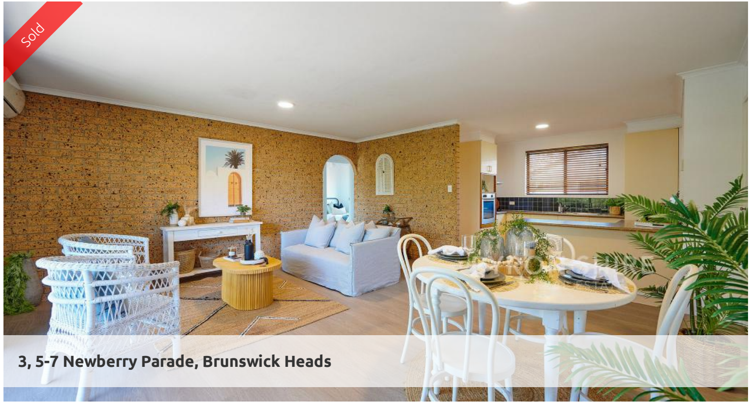
3, 5-7 Newberry Parade, Brunswick Heads