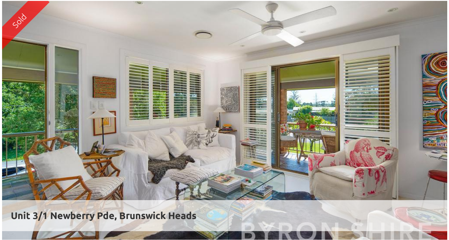
Unit 3/1 Newberry Pde, Brunswick Heads