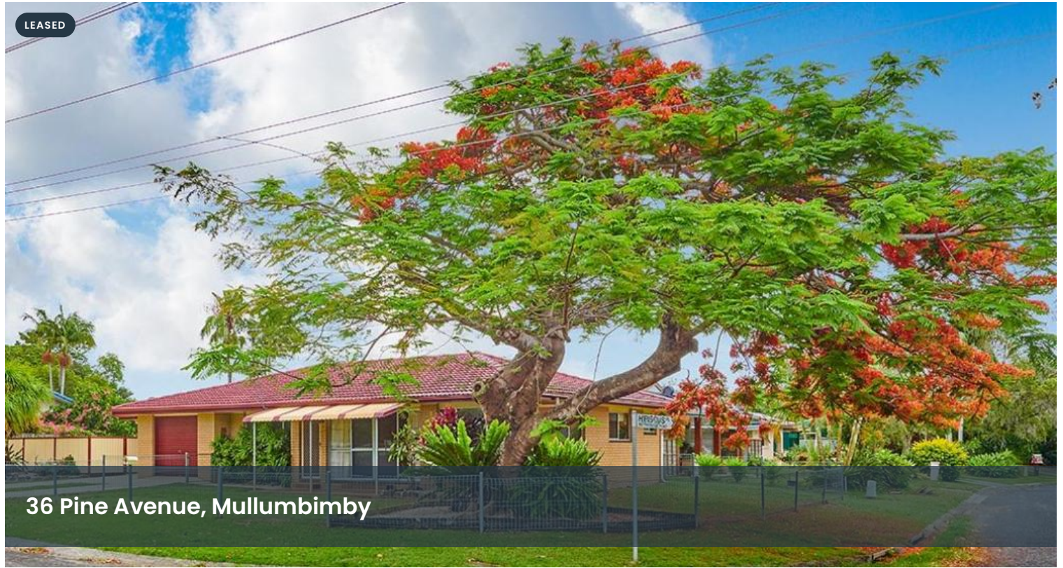
36 Pine Avenue, Mullumbimby