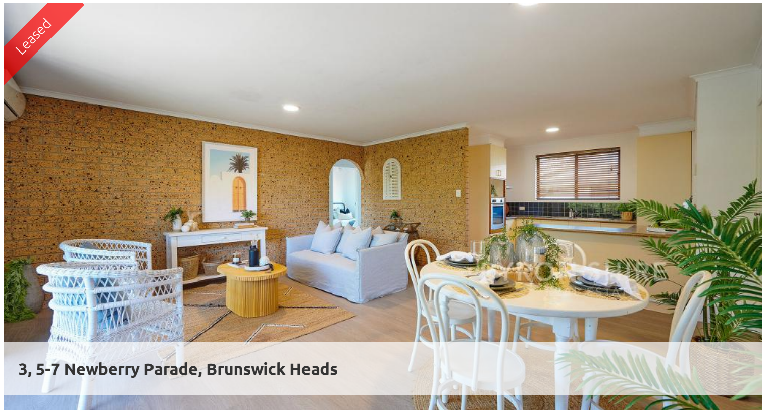
3, 5-7 Newberry Parade, Brunswick Heads