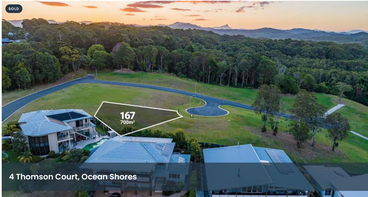
4 Thomson Court, Ocean Shores