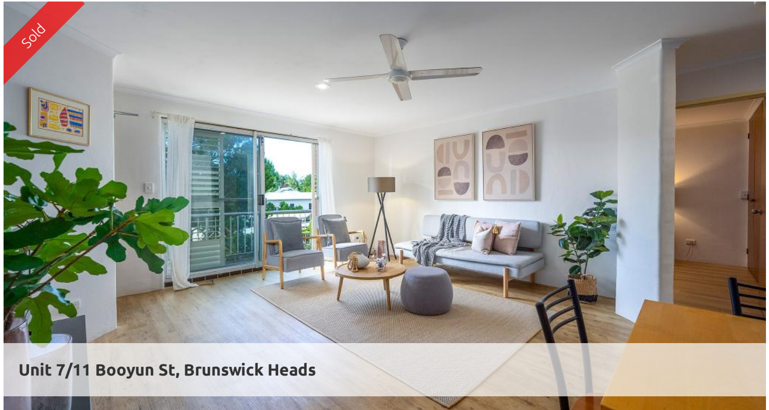
Unit 7/11 Booyun St, Brunswick Heads