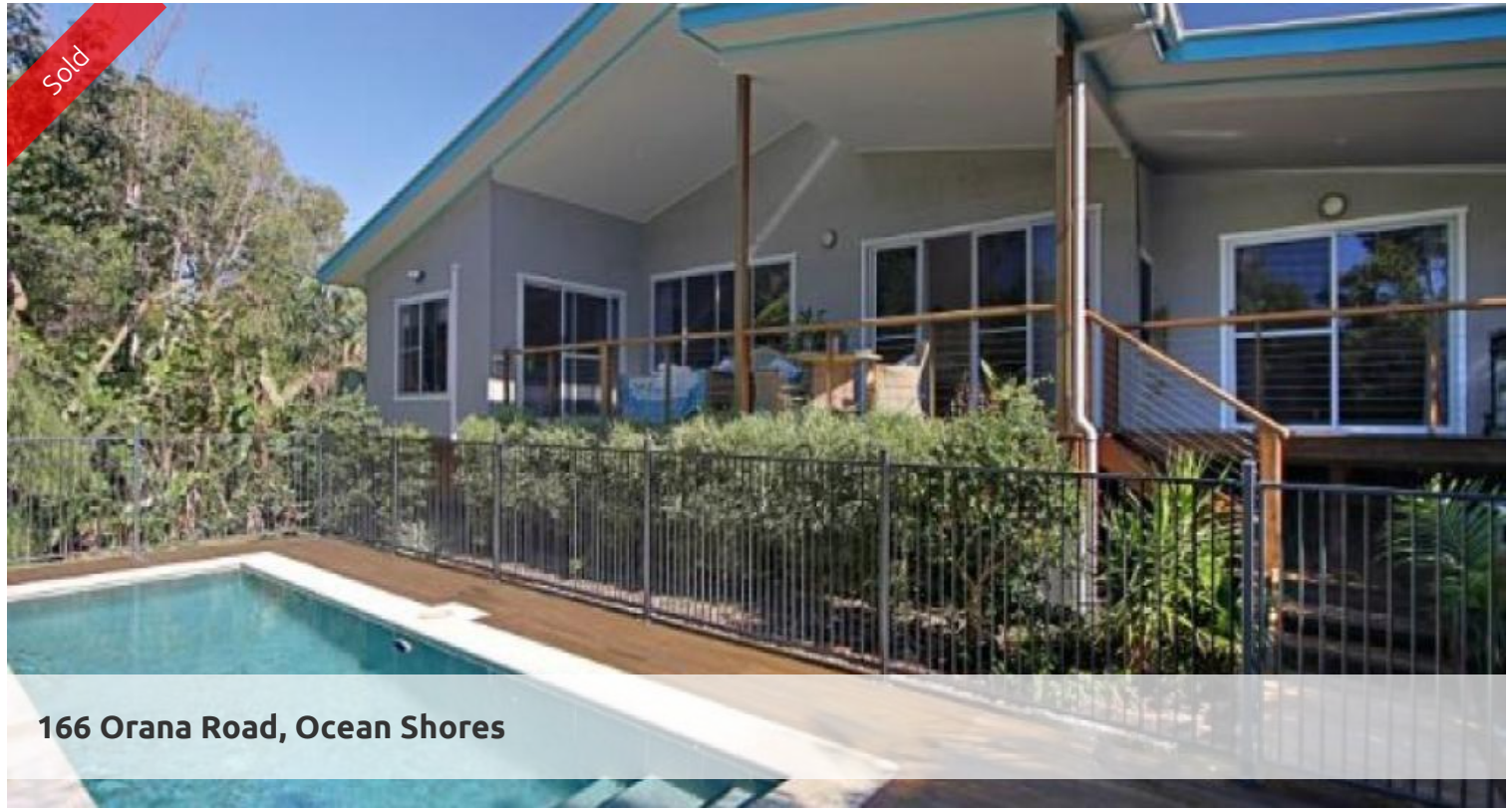
166 Orana Road, Ocean Shores