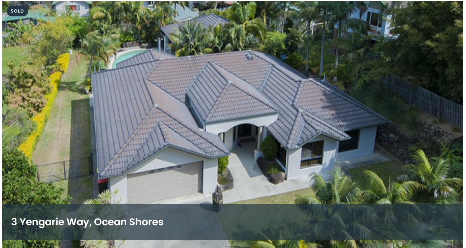
3 Yengarie Way, Ocean Shores