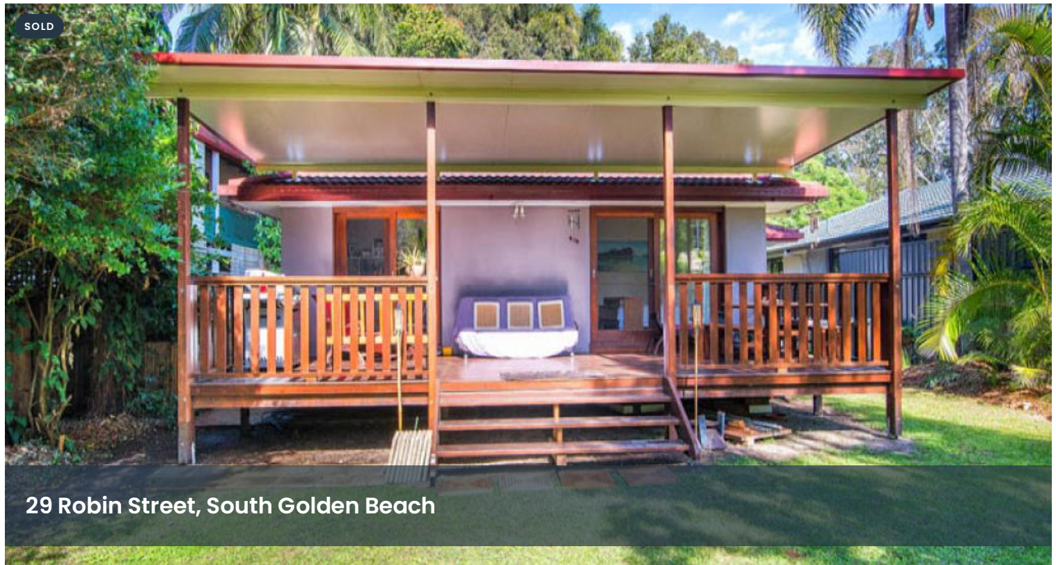
29 Robin Street, South Golden Beach