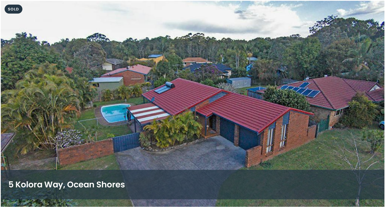
5 Kolora Way, Ocean Shores