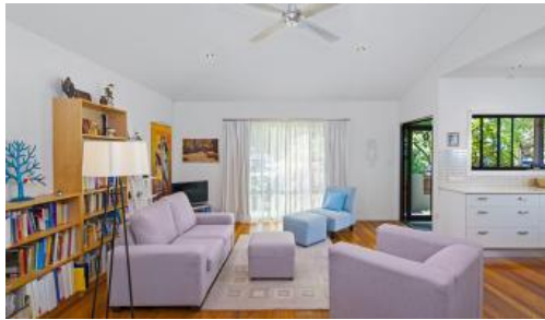
Villa 4, 20 Booyun Street, Brunswick Heads