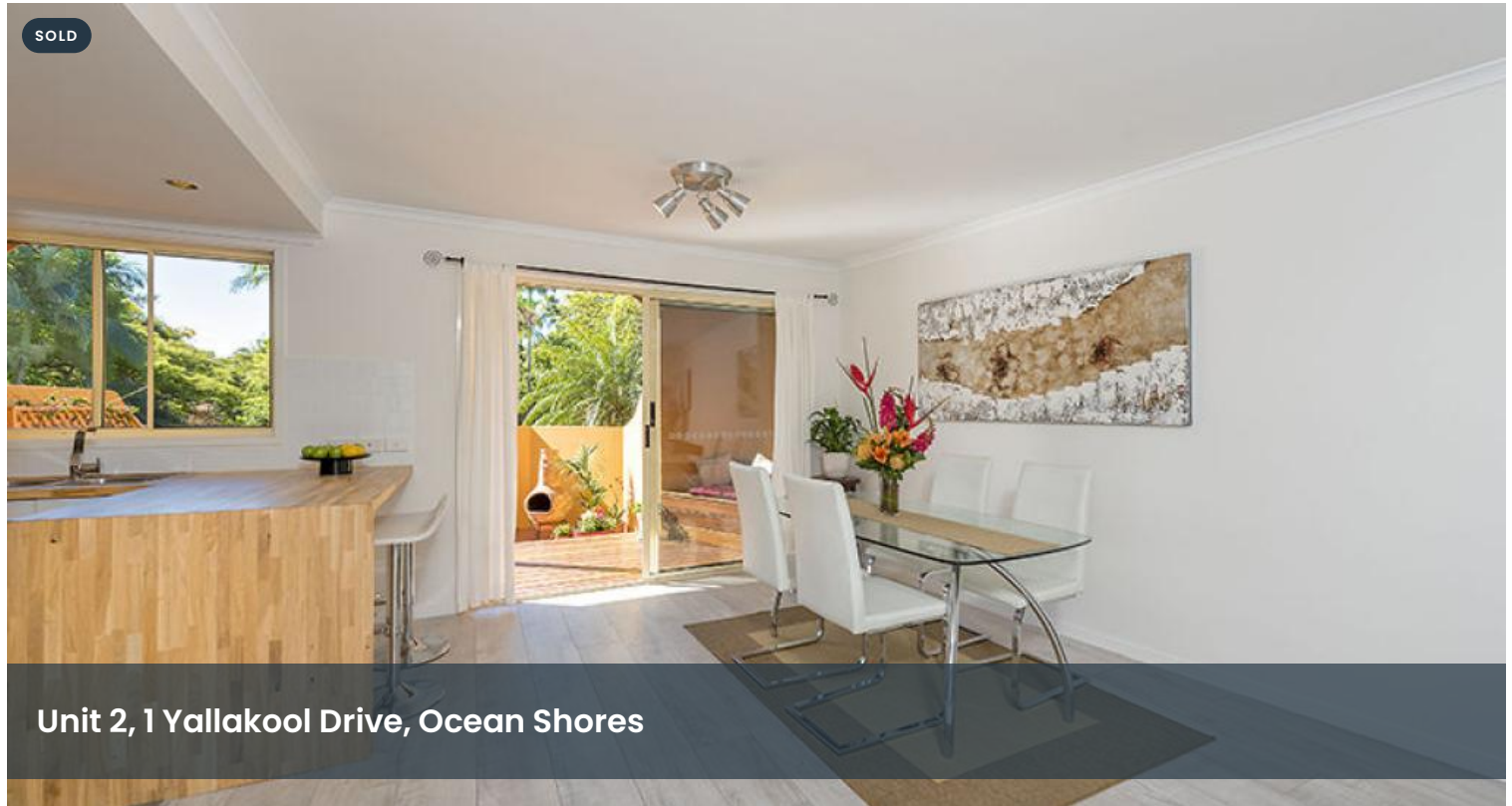
Unit 2, 1 Yallakool Drive, Ocean Shores