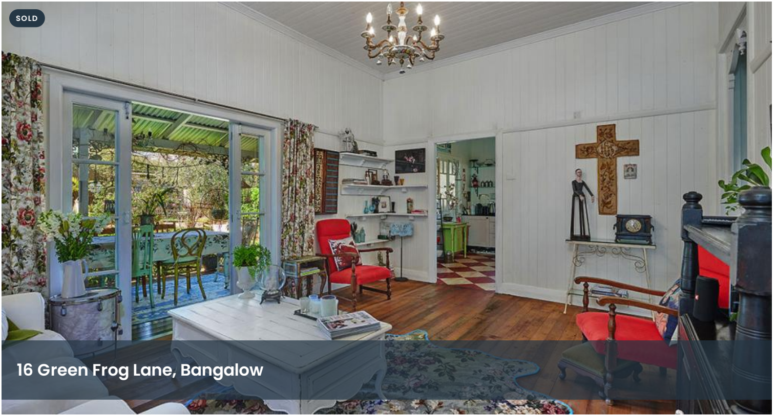
16 Green Frog Lane, Bangalow