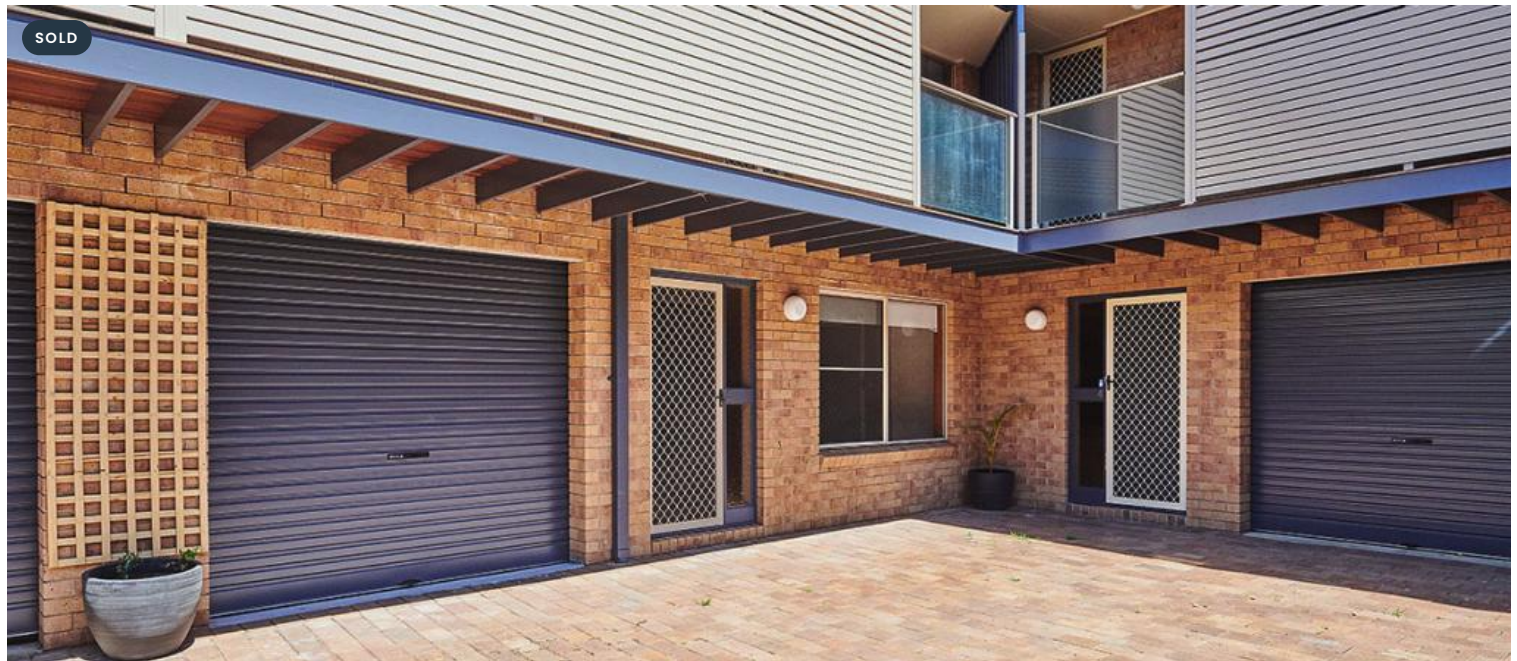
Unit 5, 1 Bindaree Way, Ocean Shores