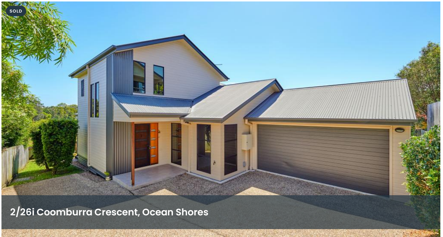
2/26i Coomburra Crescent, Ocean Shores