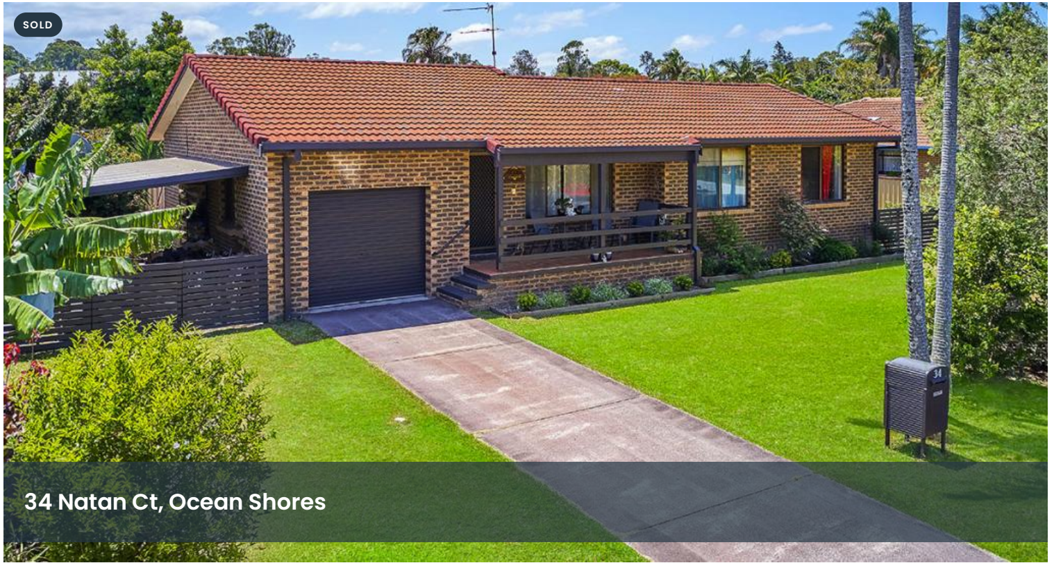
34 Natan Ct, Ocean Shores