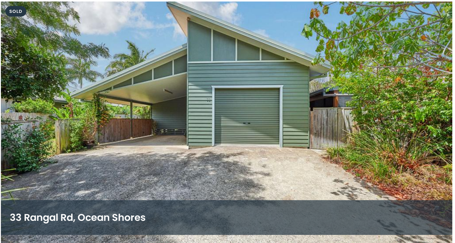
33 Rangal Rd, Ocean Shores