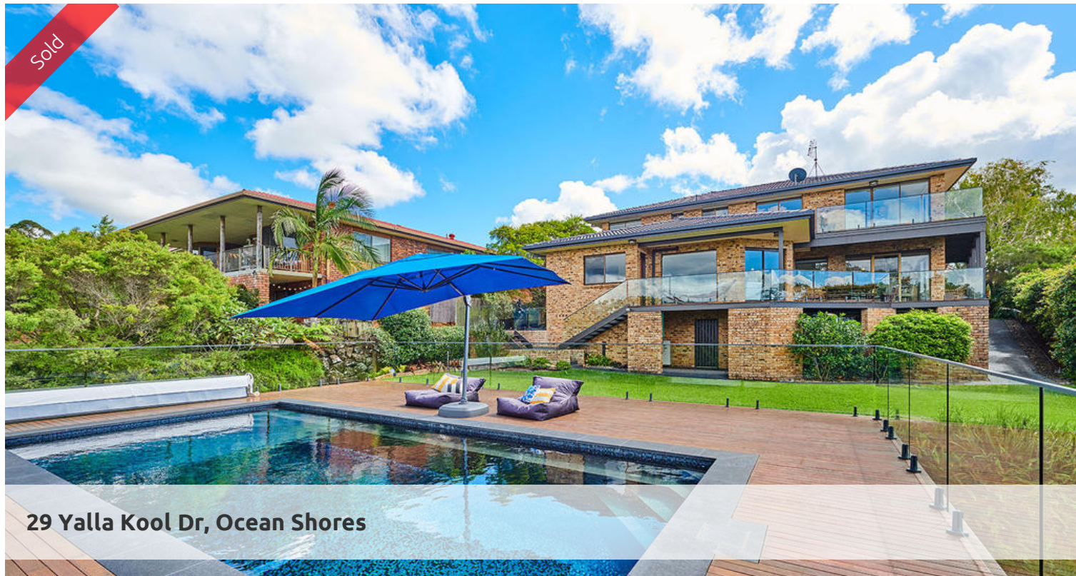
29 Yalla Kool Dr, Ocean Shores