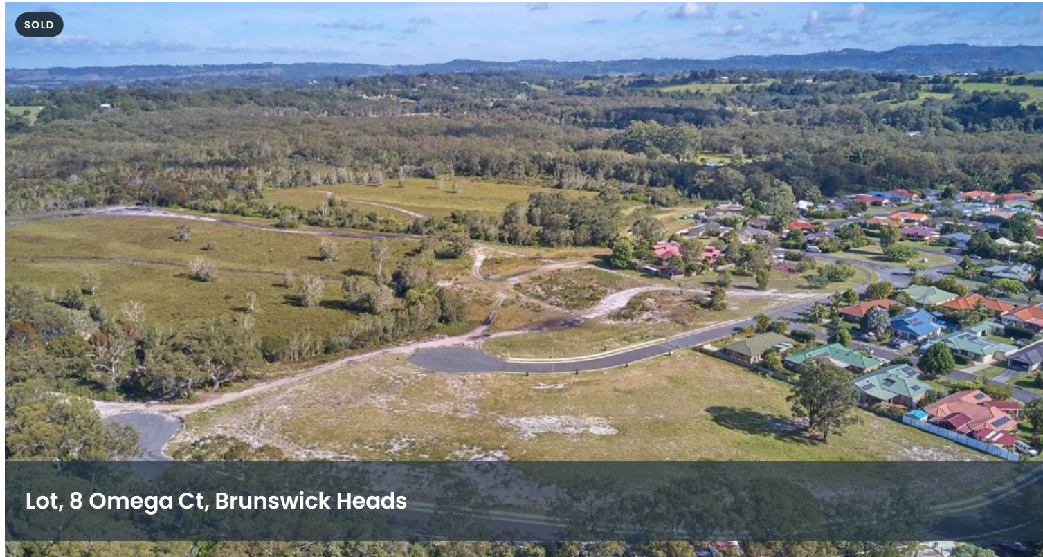
Lot, 8 Omega Ct, Brunswick Heads