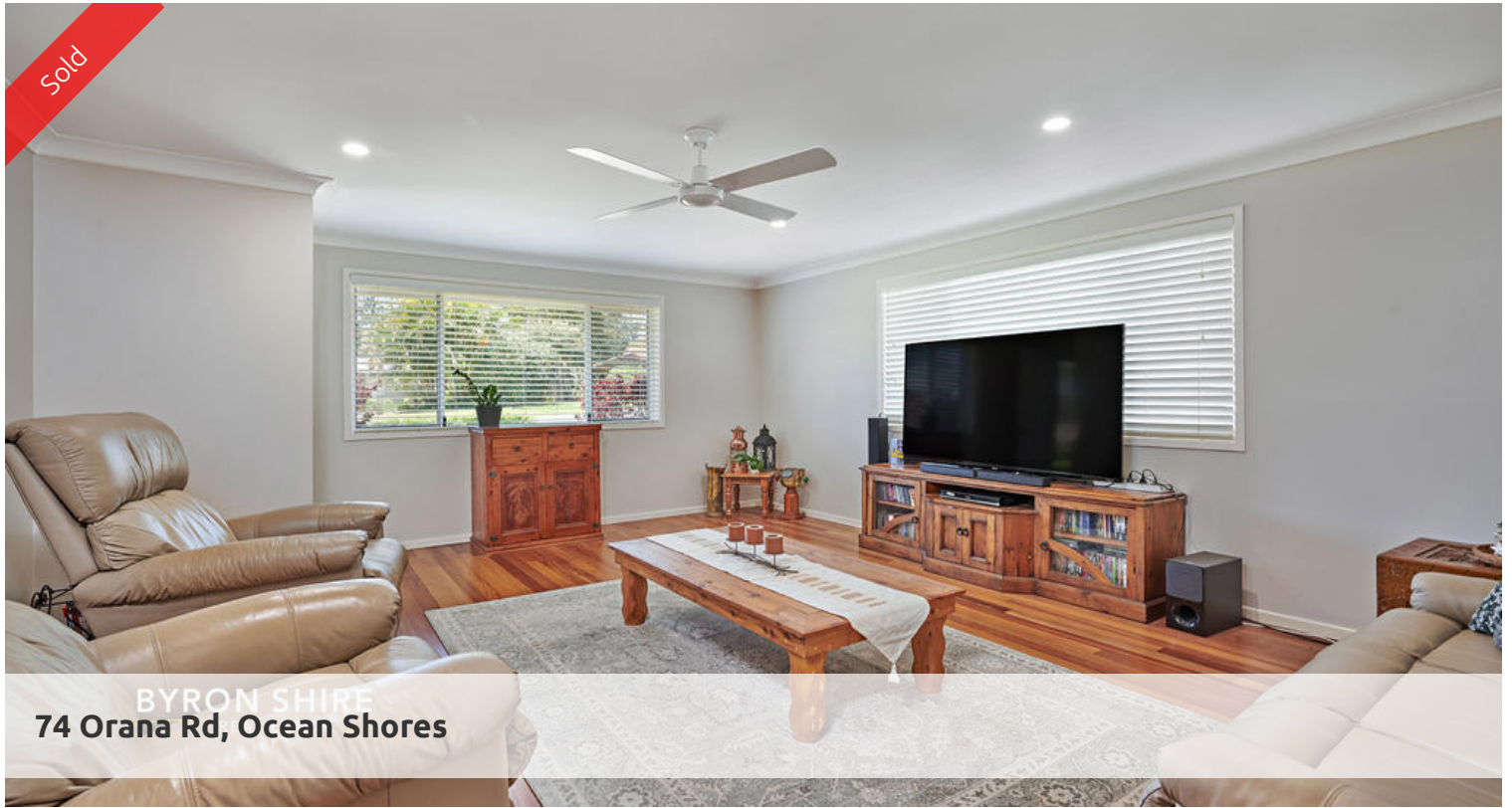
BYRON SHIRE 74 Orana Rd, Ocean Shores