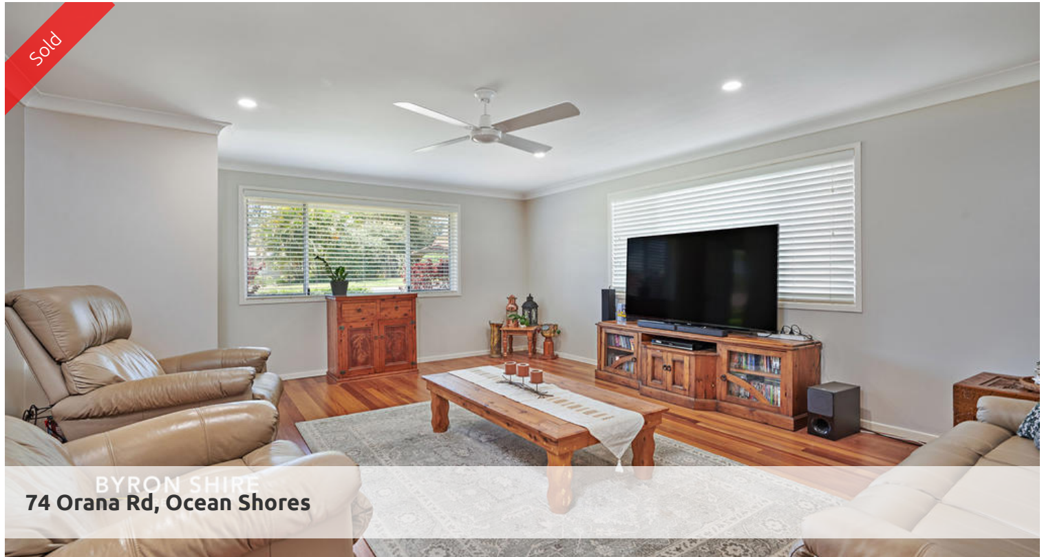
BYRON SHIRE 74 Orana Rd, Ocean Shores