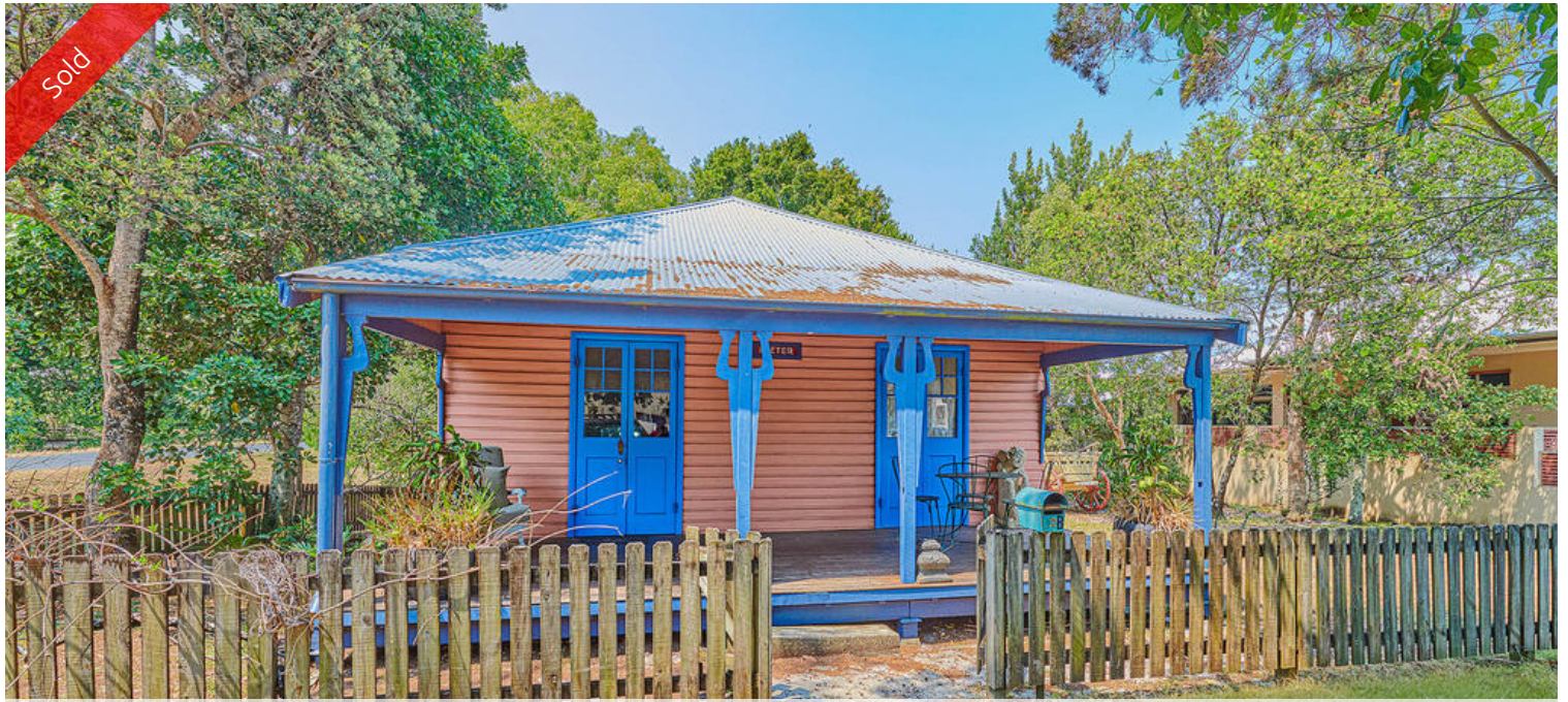
2B Booyun St, Brunswick Heads