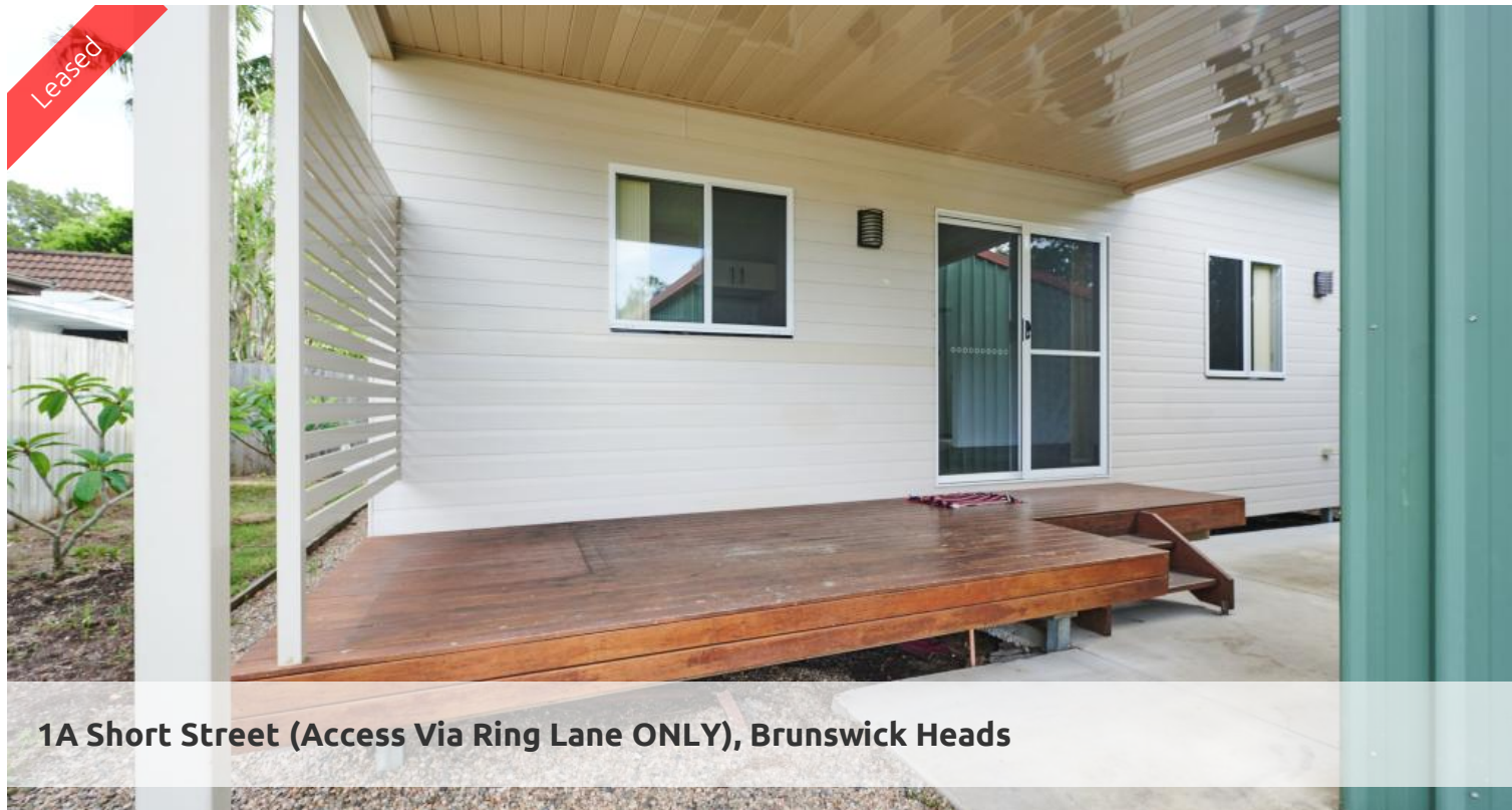
1A Short Street (Access Via Ring Lane ONLY), Brunswick Heads